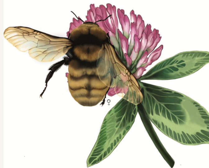
Bombus fragrans (Pallas, 1771)