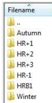
Figure 2 - Directory structure for the ortho image return of the MS

11.2.3 Directory structure by HR period: