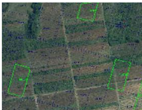
Figure 3. Cadaster parcels (dashed blue polygons) based on virtual division not following physical reality as visible on imagery