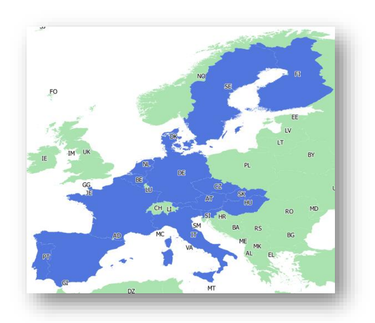
Figure 2. Geographical distribution of experts in the 2020.1 MIWP Action

The working group established to work on the tasks foreseen by the action consists of representatives of standardisation bodies, data providers, software projects and European Commission services. The map below shows the geographical distribution of the working group members.