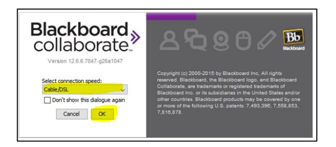
2.8 Welcome to the Blackboard Collaborate<sup>™</sup> session! ☺

2.5 Choose connection speed => Cable/DSL and click "OK" and wait for the software to load.