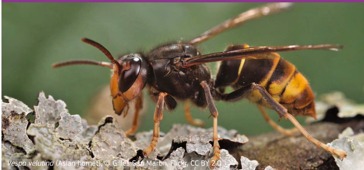
Vespa velutina (Asian hornet)

The fight against the Asian Hornet is one of the cross-cutting topics in Vitoria-Gasteiz's Local Biodiversity Strategy. The Asian Wasp was introduced to the region via Bordeaux (France) five years ago. Since then, and due to its aggressive and adaptable nature, it has become a threat to local populations of pollinators, especially honeybees. The city's actions to control this pest are based on two steps: 1) the identification and capture of hibernating wasp queens in early spring with the use of bait (financed by the regional government), and 2) the removal of nests once the queen has settled and produced a colony (financed by the municipality). The latter step is conducted by local firefighters (responsible for 90 percent of nest removal) with some support from local citizens. Through an emergency protocol, citizens that spot (and correctly identify) a nest of Asian Hornet are expected to warn firefighters who will then proceed to eliminate. Despite these efforts and their relative success, the whole process remains costly, and new complementary measures need to be found for the eradication of the invasive Asian Hornet species.