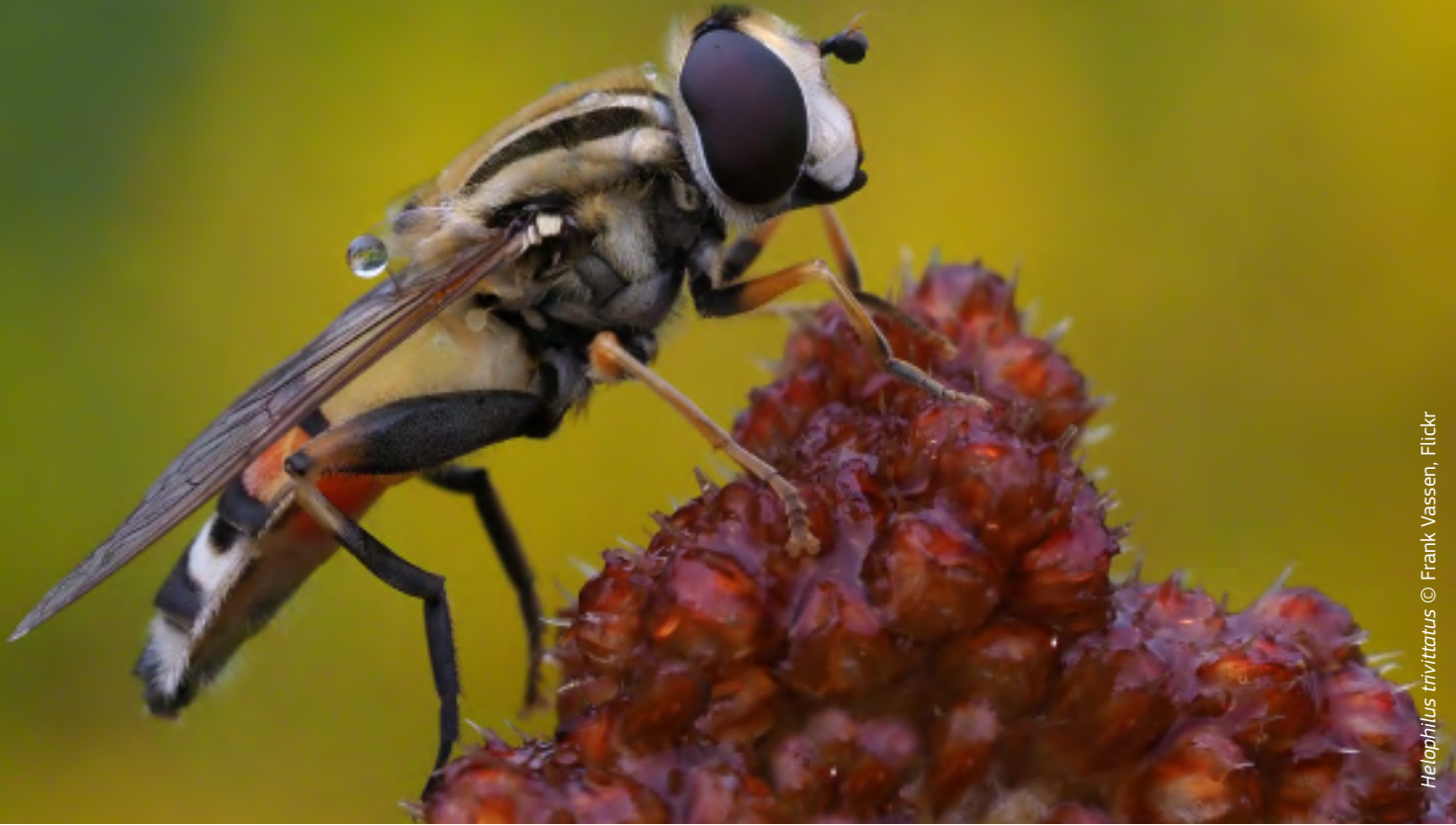
Helophilus trivittatus