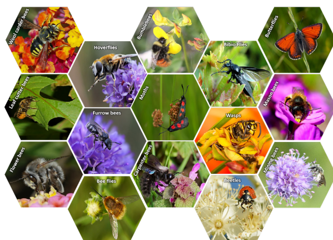
Figure 1. A snapshot of the diversity of wild pollinators

There is growing recognition from a wide range of stakeholders, including regulatory agencies, customers and financial institutions, that biodiversity, including the protection of wild pollinators, needs to be integrated into government, financial and corporate policies and into the operations of companies within the extractives sector.