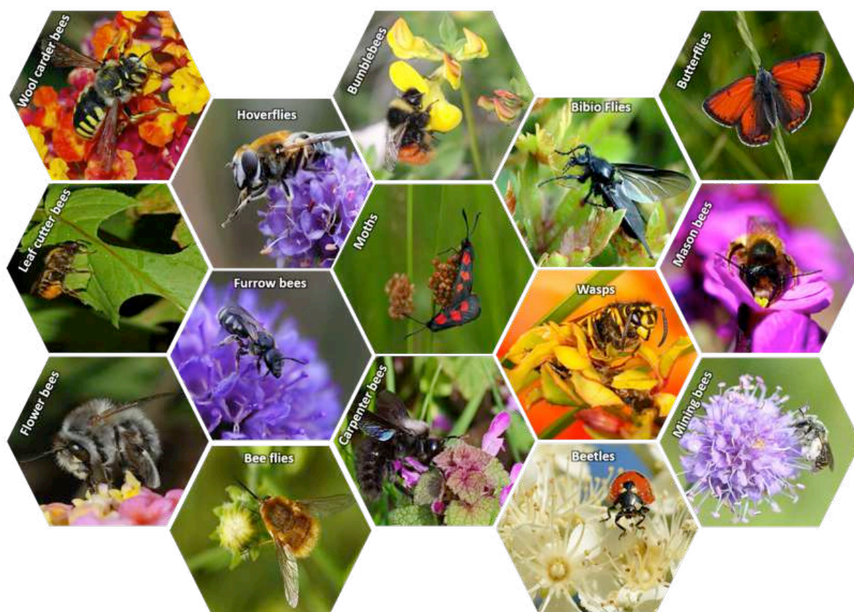
Figure 1. a snapshot of the diversity of wild pollinators - see Annex 1 for photo credits

Pollinators – such as bees, hoverflies, moths, butterflies and beetles (Figure 1) – are declining dramatically around the world, and Europe is no exception [1, 2]. Many species are threatened with extinction creating a pollination deficit [3]. This puts managed and natural ecosystems functioning at risk, with businesses facing possible serious shortages of raw materials, a decline in crop quality and challenges with the security of the supply chain.