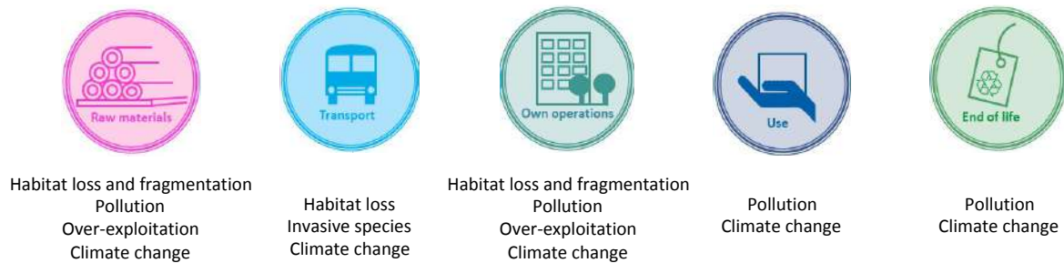
Figure 2. Value chain link with key drivers of biodiversity loss

Any business is a value chain. The link between the key drivers of biodiversity loss (which result in environmental and social impacts) and the value chain is shown in Figure 2.