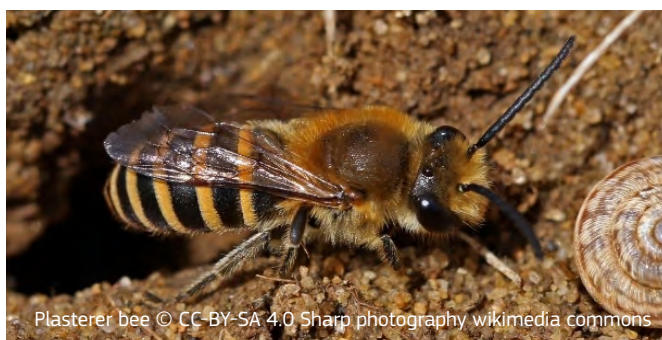
Plasterer bee

Pollinators need places (habitats) with food, water and shelter to raise their young and an unpolluted environment to thrive. You can take various actions to help with these needs and support the wellbeing of pollinators - as an individual or with your family, friends, and wider community. Pollinator conservation actions can take place in your personal space (your home and garden) or common spaces in your neighbourhood and wider area. You can also help the pollinators by becoming a pollinator-friendly consumer and a citizen scientist .