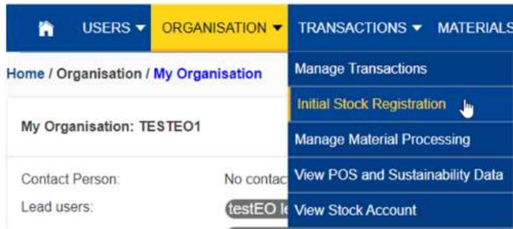
Fig 1. Initial Stock Registration menu option

When the section opens the User can then add the initial stock details by clicking on the 'Register Initial Stock' button.